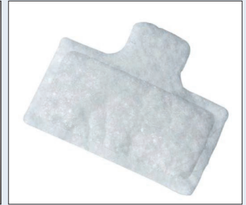
2 Disposable CPAP Filters