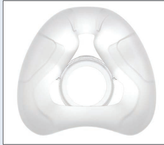
2 Nasal Seals